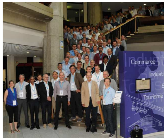
Group photo of attendees of the 1 st European Cryogenics Days, June 4-5, 2016

20 min, related to the same topic and presented either by CERN or non-CERN staff. There are already quite some suggestions on topics as well as on speakers, so please block your agenda for these dates!