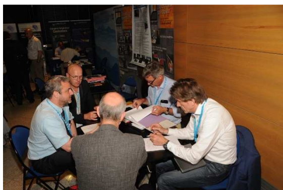
CSE-board meeting at the 1 st European Cryogenics days June 2015 in Grenoble

with ESAS we intend to organise the 2017 follow-up of the International Workshop on Cooling Systems for HTS Applications (IWC-HTS).